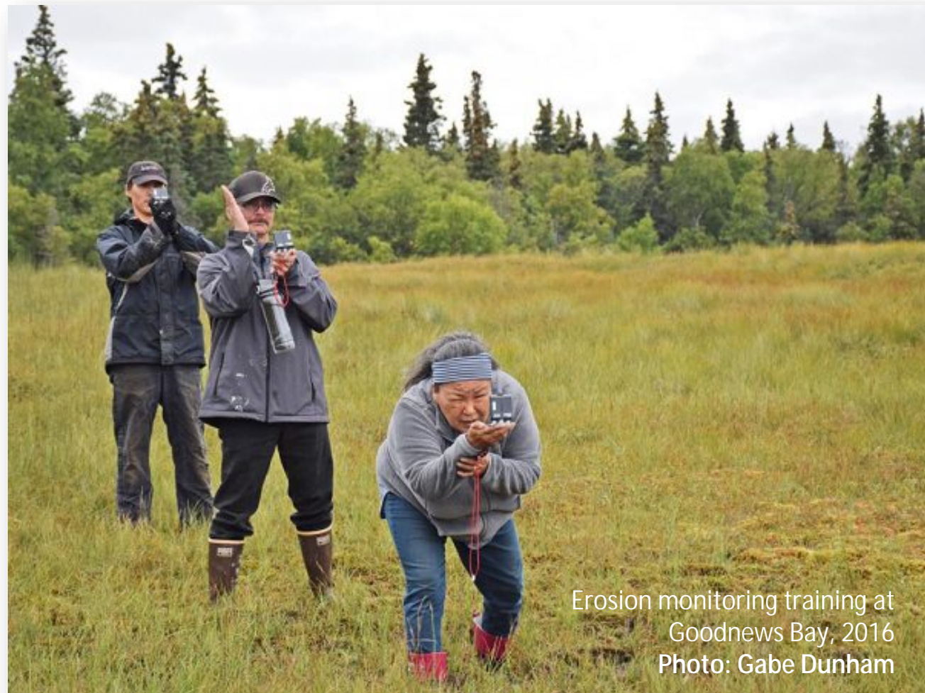
Erosion monitoring training at Goodnews Bay, 2016