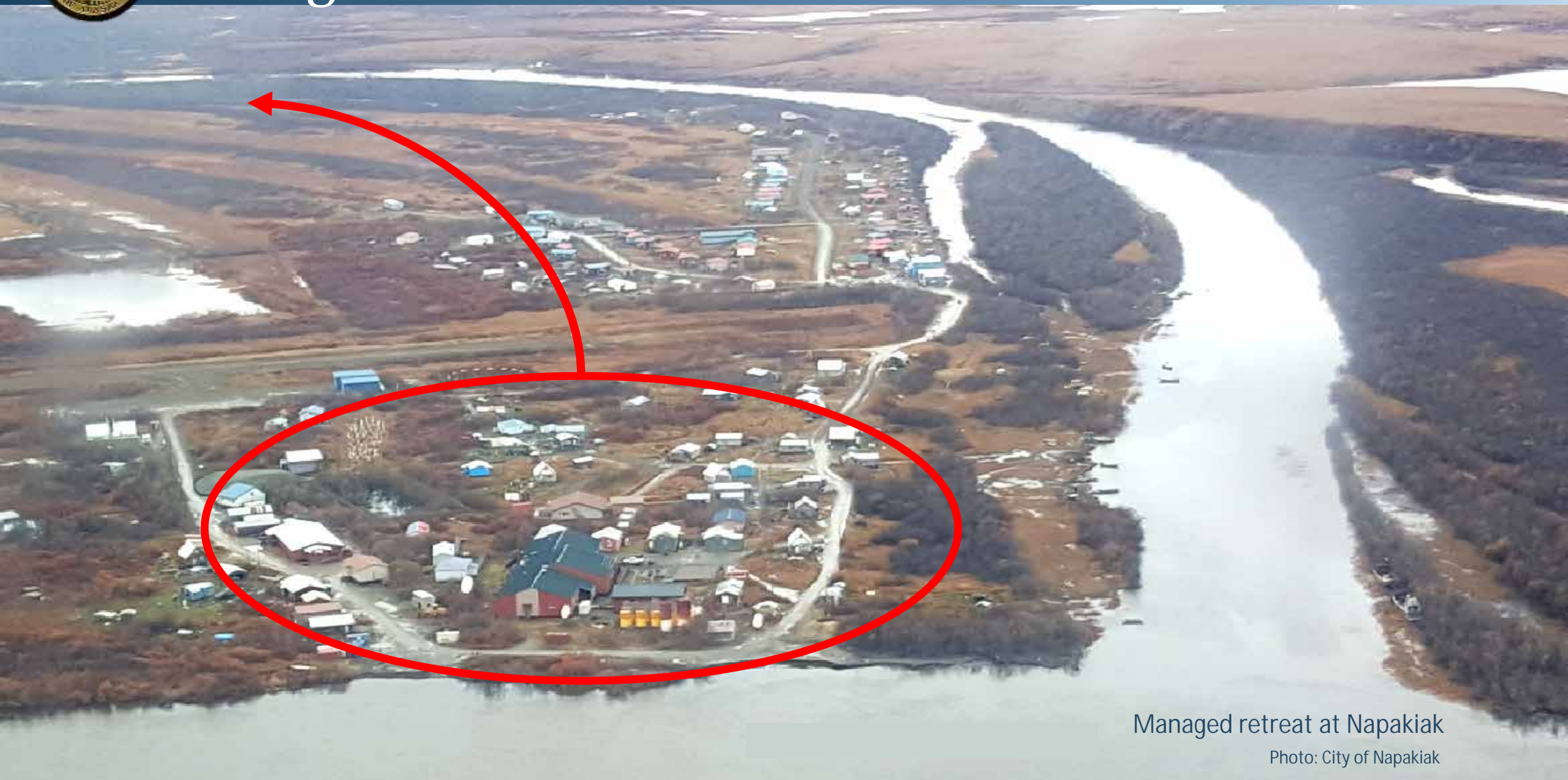
Managed retreat at Napakiak