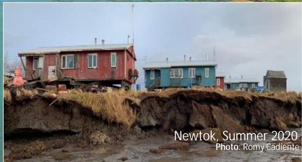
Newtok, Summer 2020