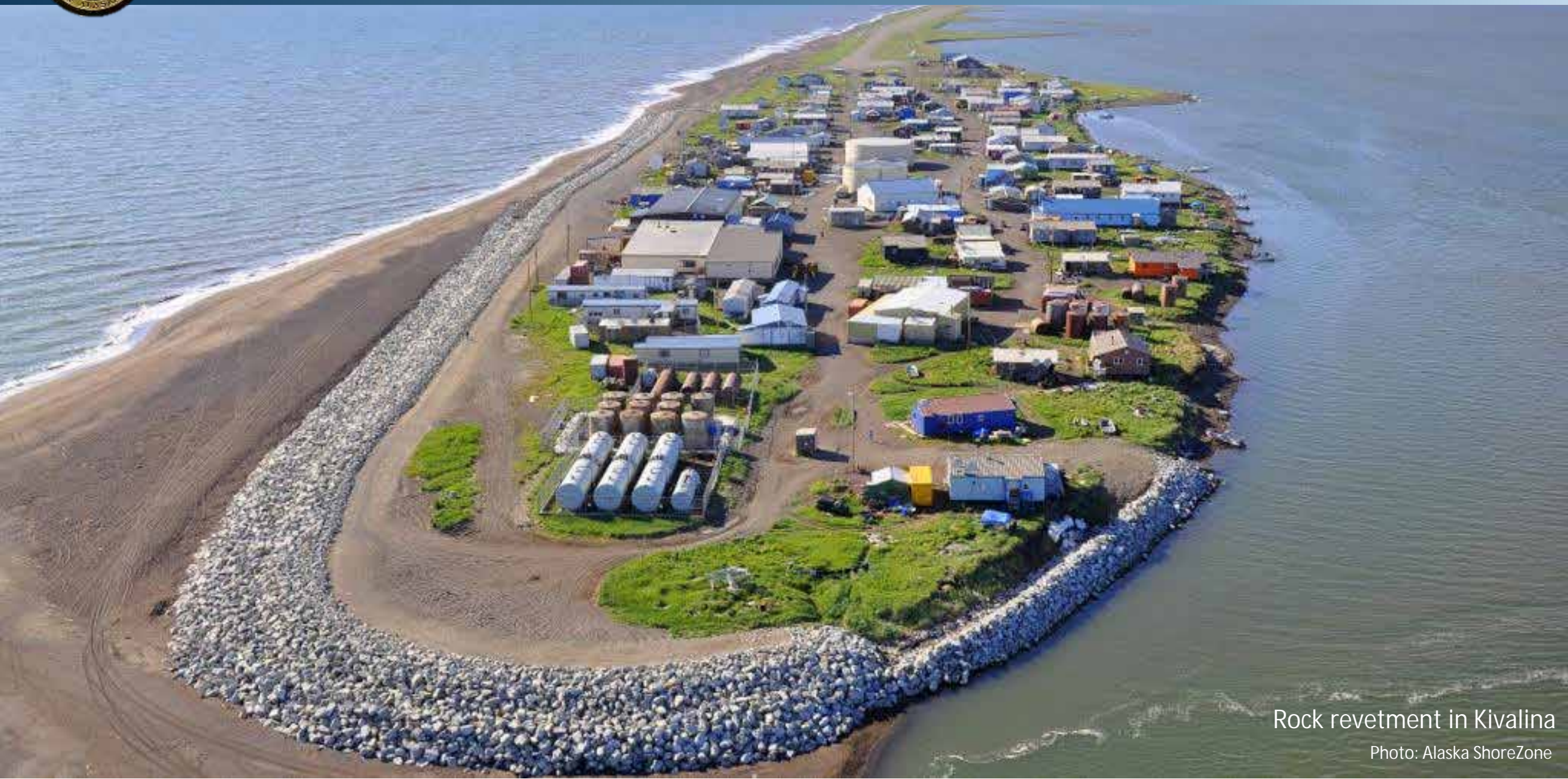
Rock revetment in Kivalina